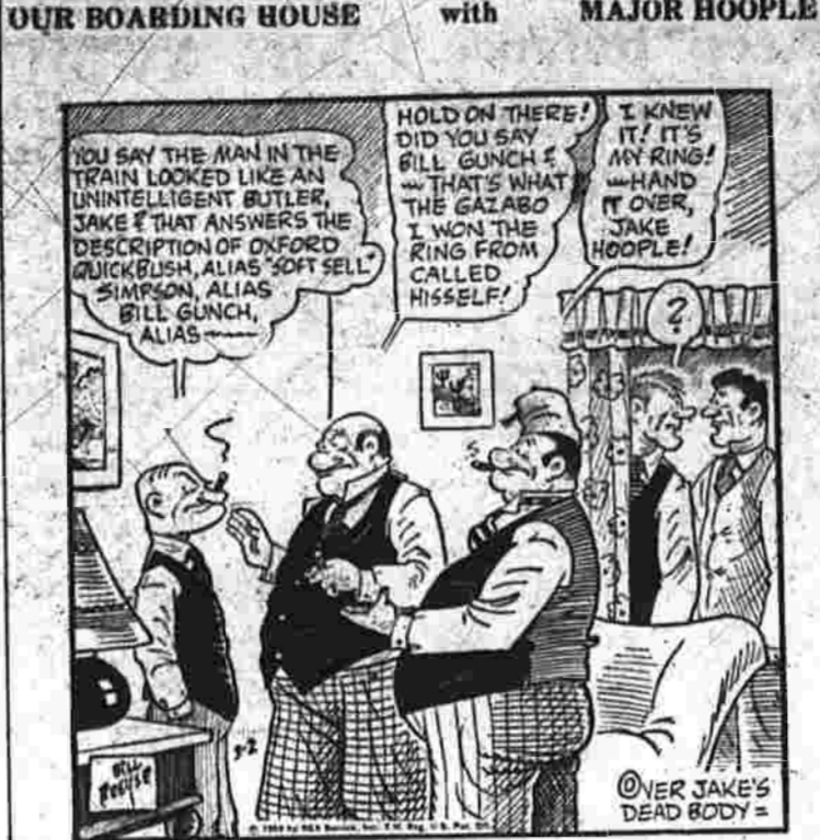
with MAJOR HOOPLE