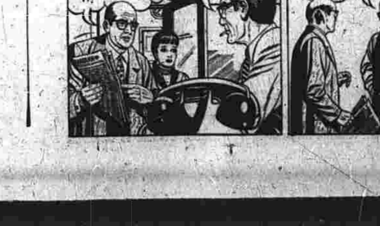
BY PETE HOFFMAN