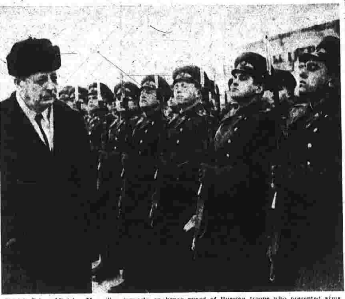
British Prime Minister Macmillan inspects an honor guard of Russian troops who presented arms on his arrival at Kiev from Moscow. The prime minister returned to Moscow for a final conference with Soviet Premier Khrushchev this morning.