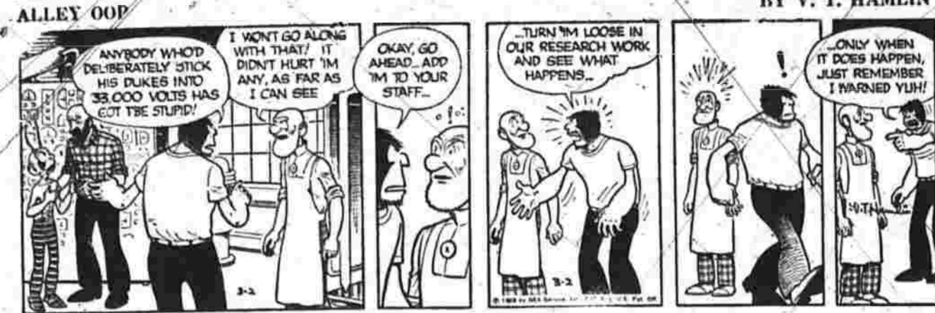
BY V. T. HAMLIN