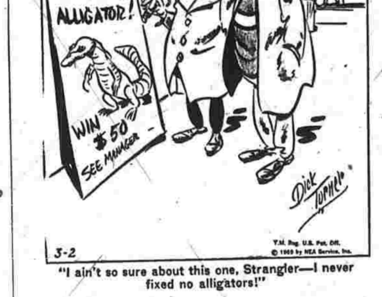
BY FRANK O'NEAL