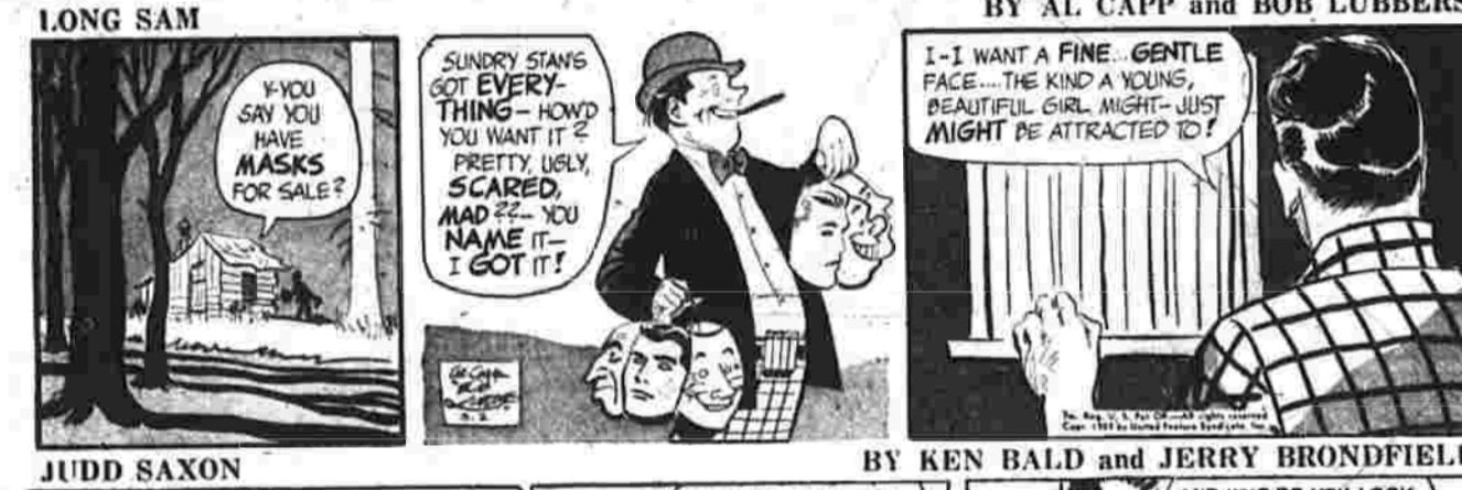
BY AL CAPP and BOB LUBBERS