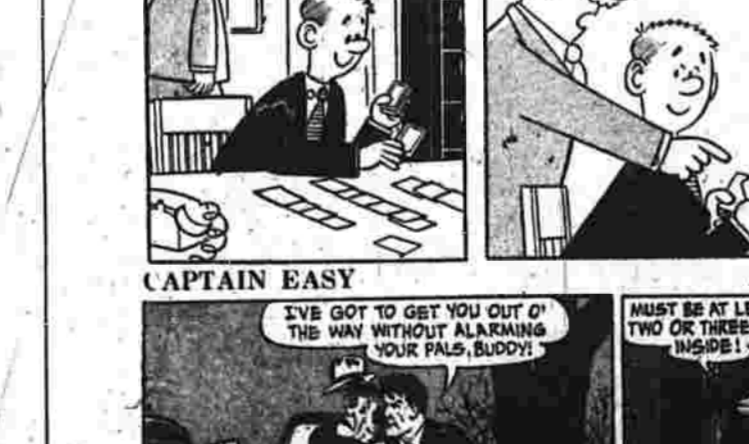
BY DICK CAVALLI